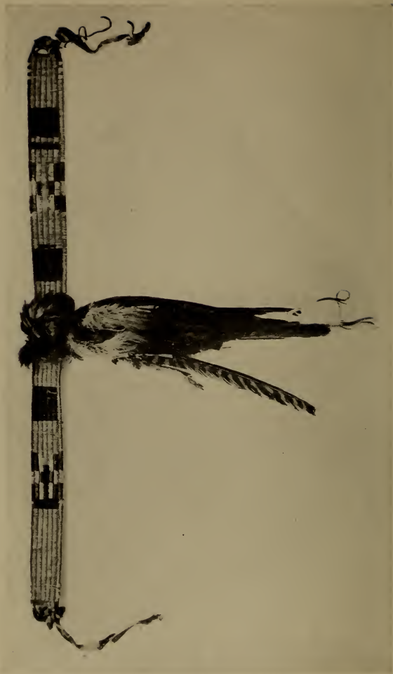
BIRD-QUILL BELT OF THE SAUK AND FOX (REVERSE)